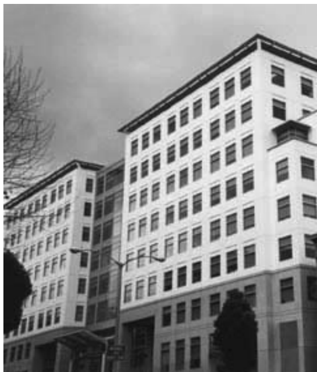
Kaiser Medical Office Building – San Francisco with: 1065 TF-HC 66 TB-EST 72 TL THERMA-FUSER™ thermally powered vav diffusers

If each room could have its own controls, patient and staff comfort would be enhanced – but how can that be done given limited construction budgets?